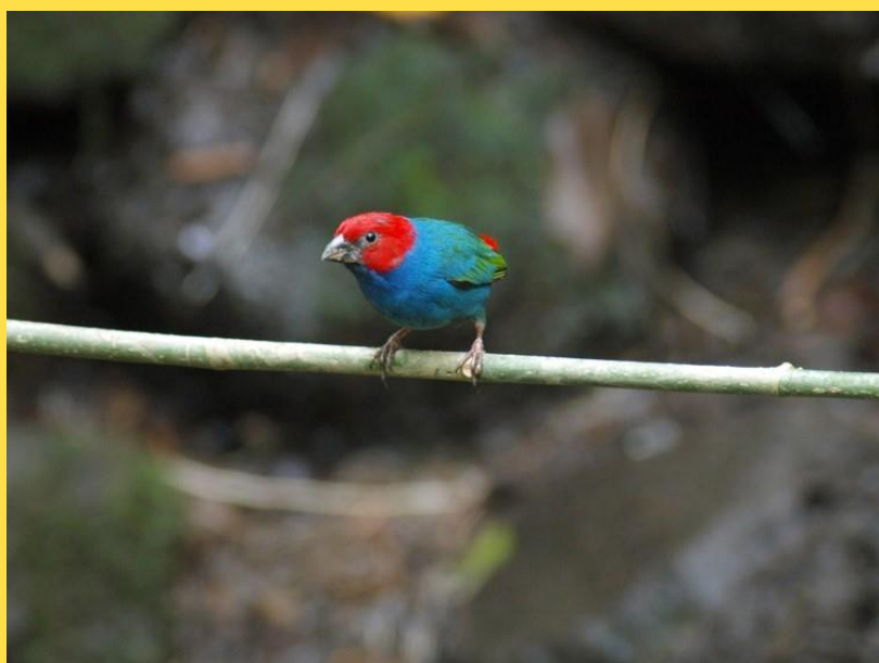
Royal Parrotfinch

Wan KBA hemi wan eria we i: kat biodaevesiti we i stap long denja blong lus; biodaevesiti ia i stap long wan smol eria nomo; save sapotem hae biodaevesiti; kat ol proses we oli impoten long wan ekosistem; mo i kat olgeta biodaevesiti we sapos oli lus, bae yumi nomo save karem bak olgeta. Olgeta spisis mo ekosistem ia bae oli save stap long graon, fres wota mo solwota mo bae secretri blong KBA bae hemi mas konfemem. Vanuatu hemi kat 27 KBA.