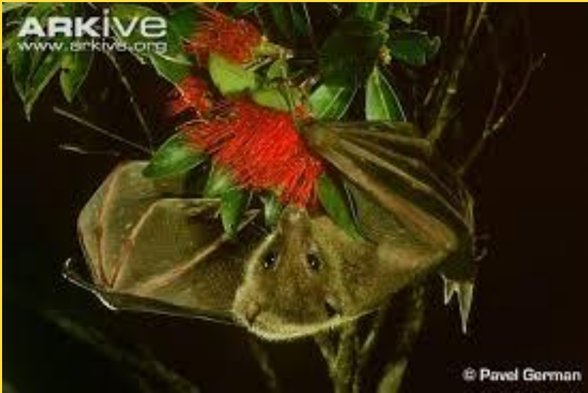
Fijian Blossom Bat

Wan KBA hemi wan eria we i: kat biodaevesiti we i stap long denja blong lus; biodaevesiti ia i stap long wan smol eria nomo; save sapatem hae biodaevesiti; kat ol proses we oli impoten long wan ekosistem; mo i kat olgeta biodaevesiti we sapos oli lus, bae yumi nomo save karem bak olgeta. Olgeta spisis mo ekosistem ia bae oli save stap long graon, fres wota mo solwota mo bae secretri blong KBA bae hemi mas konfemem. Vanuatu hemi kat 27 KBA.